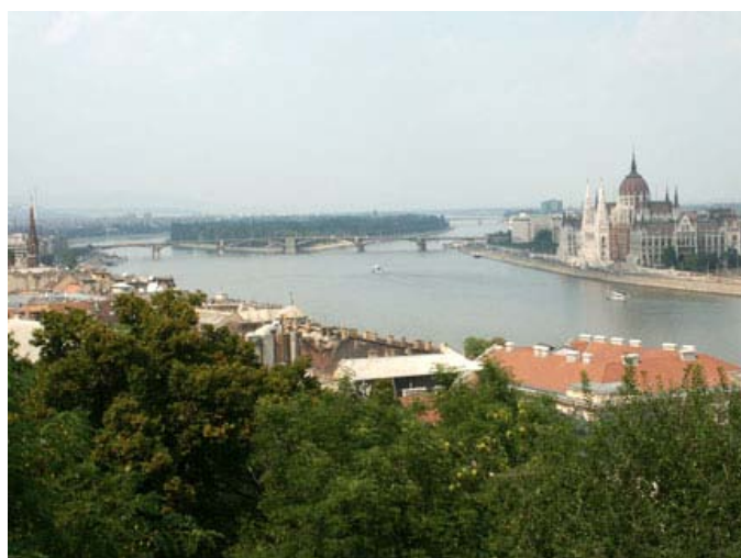
Castle Hill view