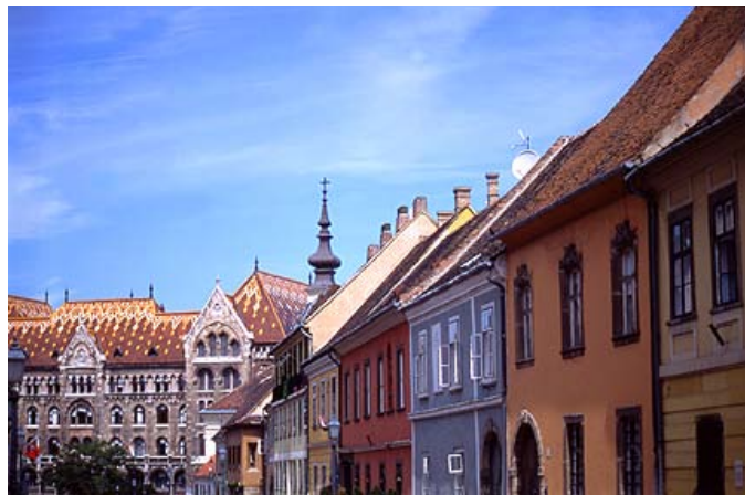
Buda Castle District