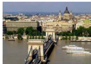
Széchenyi Chain Bridge

When considering a hotel, there are excellent options on both sides of the Danube, which will provide easy access to transportation as well as fantastic views. Facing the Széchenyi Chain Bridge is the Four Seasons Gresham Palace Hotel , the most famous hotel on the Pest side due to its meticulous reconstruction of the original splendor of the Art Nouveau elegance. The hotel is ideally located for views of Buda Castle on the Buda side of the Chain Bridge. The Corinthia Grand Hotel Royal is housed in a grand building on the Pest side on the major ring road. Each hotel offers all of the amenities expected from a world-renowned hotel group, with locations that are centrally situated for shopping and sightseeing in Pest. The Buda side offers some excellent options also. One is the fun, modern art'otel , a member of the Park Plaza chain. The hotel is decorated with art by