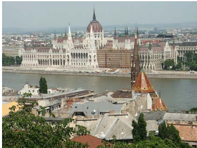
Fishermen's Bastion offers excellent panoramic views of the city

Budapest is made up of two cities, Buda and Pest, separated by the river Danube. The Pest side is livelier and offers the best shopping for items ranging from antiques and porcelain to specialty Hungarian foods and wines.