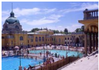
Széchenyi Thermal spa and baths

of beer is roughly 1,500 Ft ($8.50) per head. For a real culinary culture experience, try a lángos, Hungarian fried dough with shredded cheese, and garlic juice for 800 Ft ($4.50). Although you have to eat standing at a tall table, lunch here should not be missed.